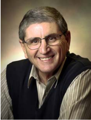
Coach Bill McCartney Founder/Chairman of the Board

THE ROAD TO JERUSALEM A MINISTRY OF RECONCILIATION